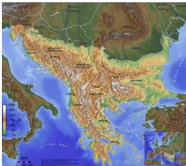
Picture 1. Balkan Semi-island