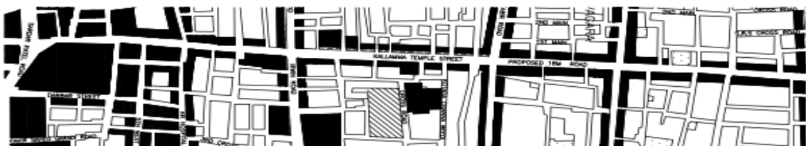
Fig 3: K.T. Street Map