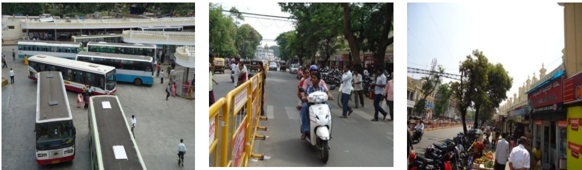
Fig 2: Photographs showing the roads of core area