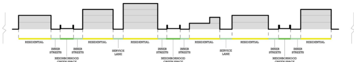
Figure 2a: Road sections through the residential block, across neighborhood greens [7]