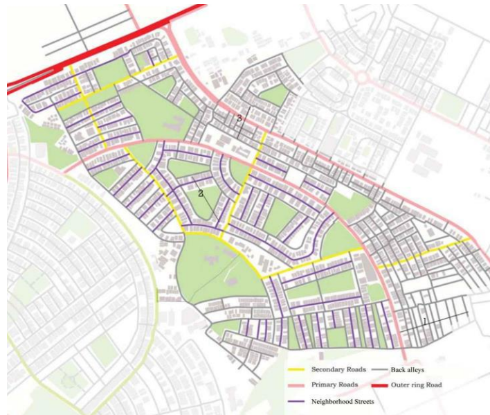
Figure 1: Plan of Chittaranjan Park with an overlay of street hierarchy [7]