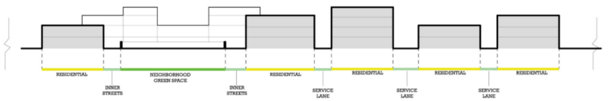
Figure 2b: Road sections through the residential block, across inner park spaces [7]