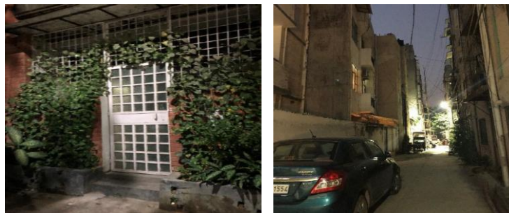
Figure 3: Images of the back alleys in Chittaranjan Park

The residents exercise great rights over the alleys in the authority of the Residents Welfare Association (RWA). Some of them are gated on both sides by the RWA. They are authorized to introduce temporary structures such as bamboo fencing, potted plants and tents for special occasions. They have the right to use this as an alternative access to their house. Some people take great advantage of this and rent out one room to students seeking cheap accommodation. These apartments are accessed from the back alley itself. An attempt to decorate the façade has been made to attract tenants. Most of these houses have created a green backyard. Because of all the reasons, the alleys are walkable and people feel safe crossing them even at night.