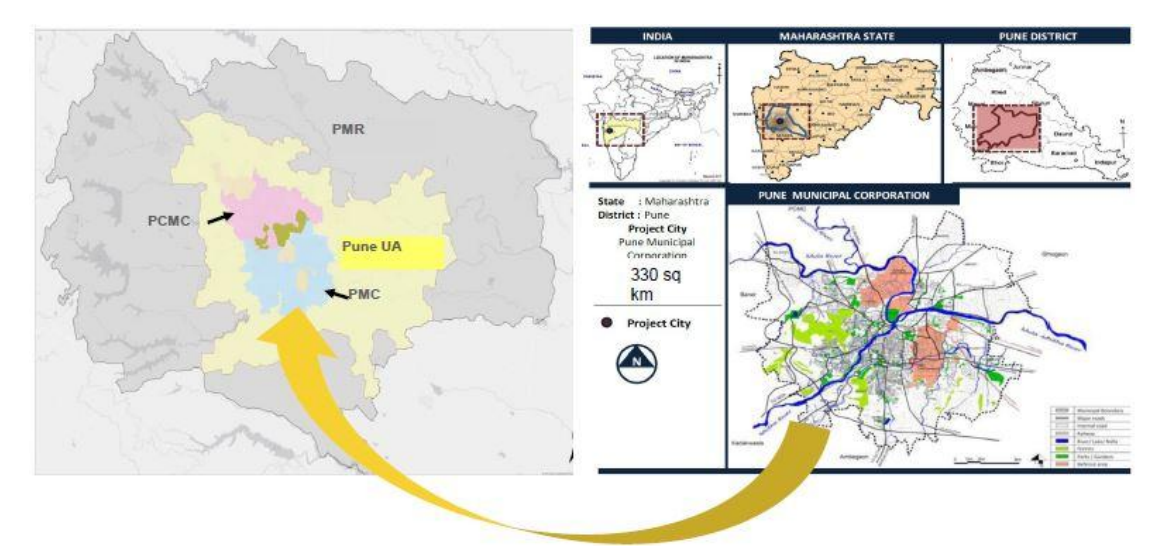
Figure 2 - Location of the study area

then in 2019 as well. Pune is also a city under 100 resilient cities under Rockfeller foundation, which is an opportunity for the scope of the study.