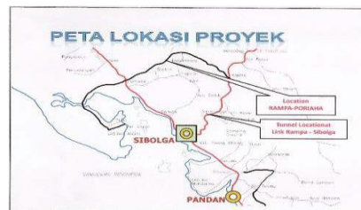
Figure 2.1 Map of Slope Handling Project Location Ruas Jalan Rambah – Poriaha /Mungkur.