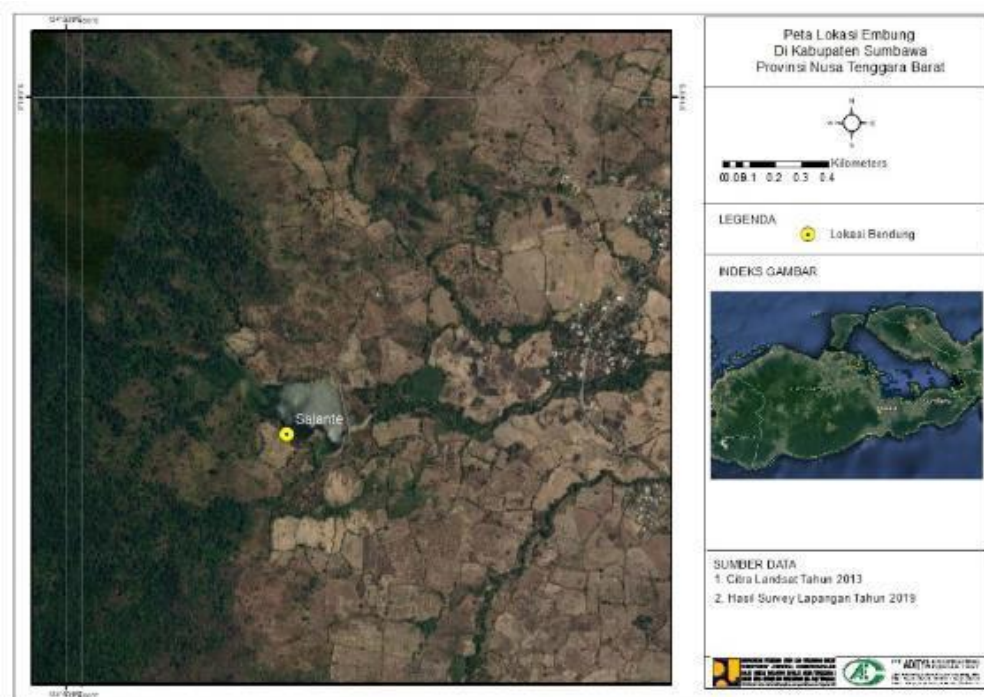
Figure 1: Site location of Totangga Dam