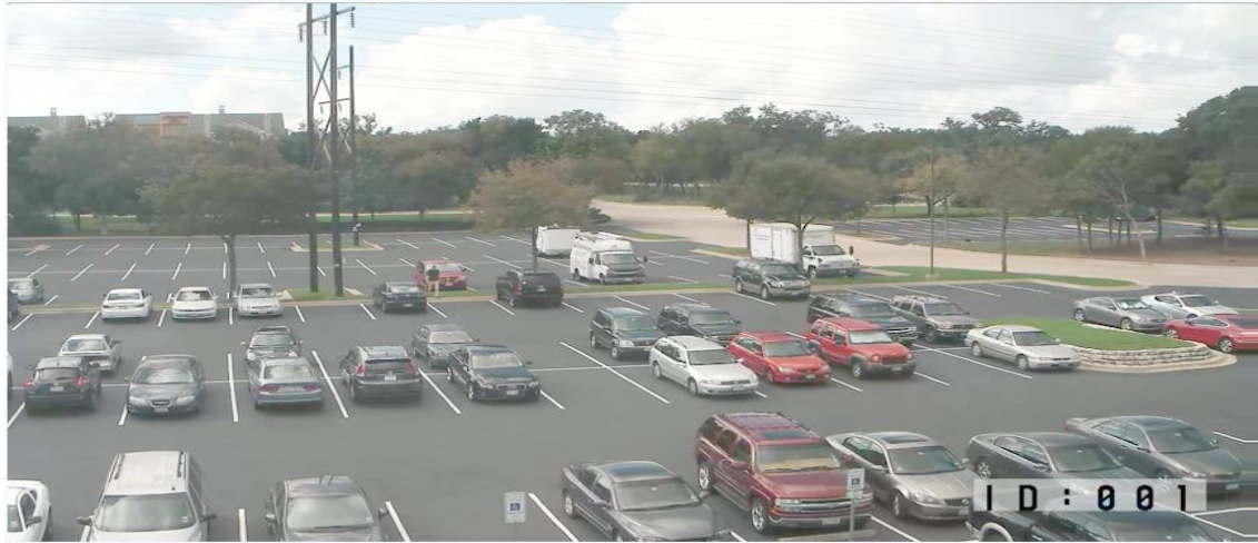
Fig: Normal Image

Edge esteem is determined in each square to distinguish regardless of whether that square contain vehicle. Assuming worth is not as much as limit esteem than that square is free and accessible for leaving vehicle and assuming worth is more noteworthy than block is involved. The face detection subsystem based on optimized Principal Component Analysis (PCA) algorithm can detect faces in cars [2].