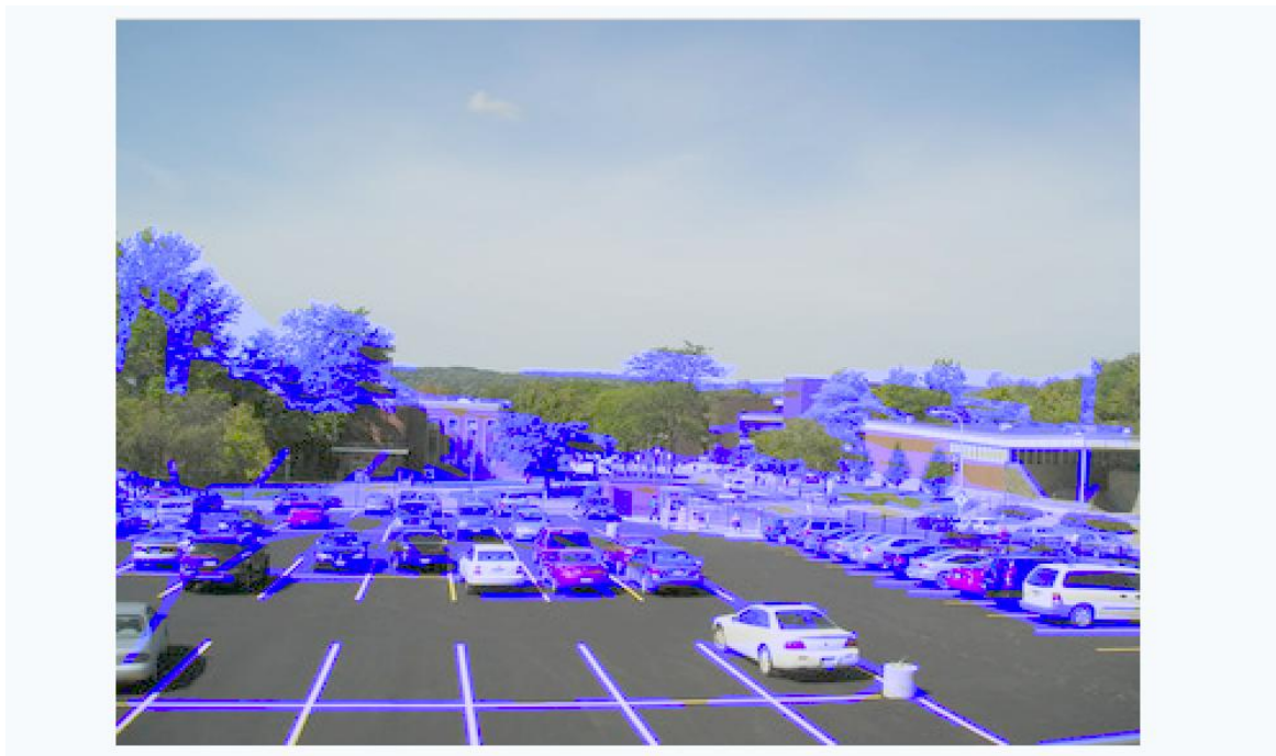
Fig: Grayscale Image