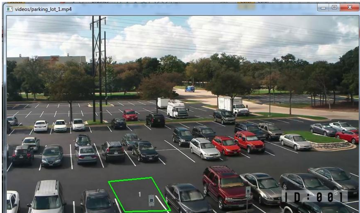
Fig: Open Slot for Car Parking