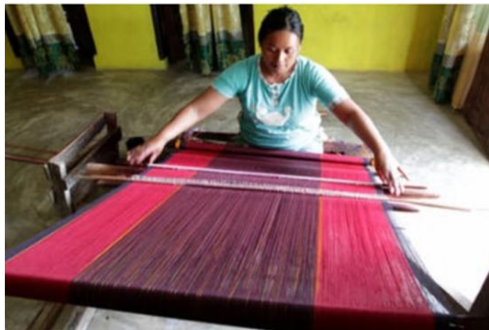
Figure 2: Weaving Ulos in Meat Village

Broadly speaking, there are four stages in weaving, namely: (i) mengunggas as the process of smearing the yarn with rice that has been pulverized and then rubbed using a round brush made of palm fiber, then the yarn will be dried before use. This process overall takes an average of 23 days, (ii) menghul-hul , which is rolling the yarn in the shape of a ball so that the dried yarn is not tangled, (iii) meng-ani , the making of strands of yarn to be used as warp in the ani tool. The yarn that has been ani will be tied at the end one by one and simultaneously rolled on the tandaian ( ani tool), and (iv) weaving is the process of forming the yarn that has been ani into a piece of ulos or sarong. Generally, a craftswoman can produce 46 pieces of ulos or sarong per year. Figure 2 shows the weaving activity.