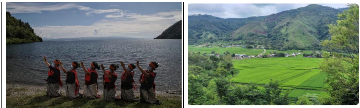
Figure 1: View of Meat Village Beach and its Agricultural Area

So far, the center of tourism development in the form of infrastructure development still seems to be centered on Samosir Island with the construction of road and bridge construction and the provision of rolling in and rolling out ferries [14]. Figure 1 shows the panoramic beauty of Pakkodian Beach, Meat Village and its rice paddy farming area.