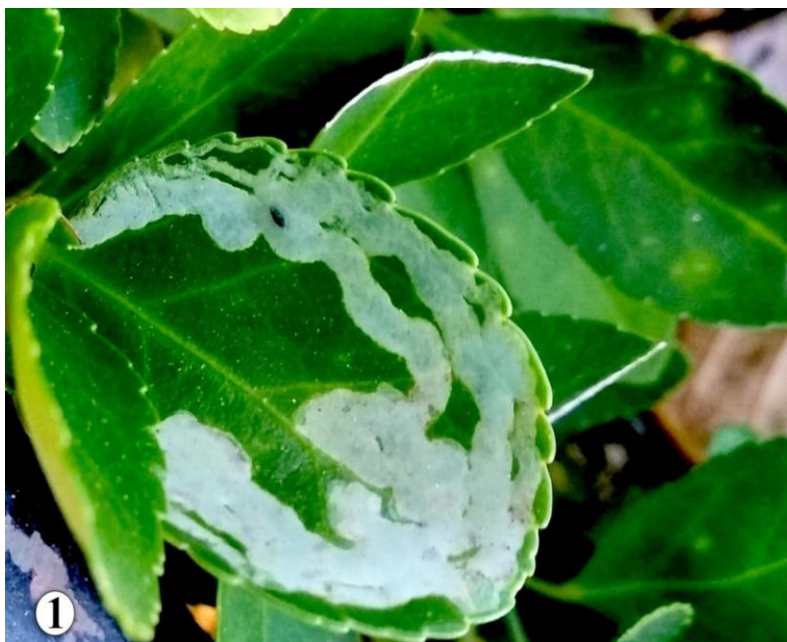
FIGURE 1: Leaf-miner infested leaf of Euonymus japonicus

Abbreviations used in text are: POL= postocellar length; OOL=oculoocellar length; Fx= funicles, x being the funicular segment number; SMV= submarginal vein; MLM= midlobe of mesoscutum; MV= marginal vein; PMV= postmarginal vein; STV= stigmal vein; sp. nov. =new species. All measurements used are in millimeters (mm).