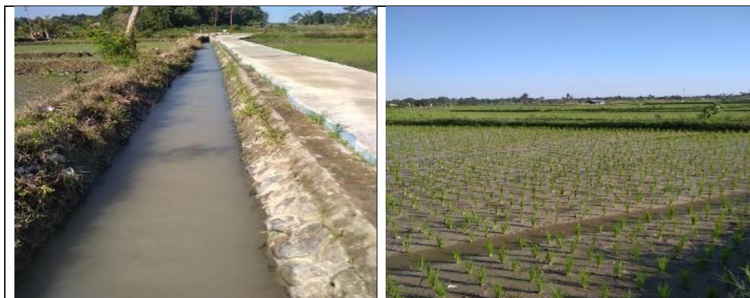
Figure 1. Irrigation System and Paddy Cultivation as Primary Commodity

drained. This condition can be achieved due to the availability of technical irrigation systems that function correctly (figure 1).