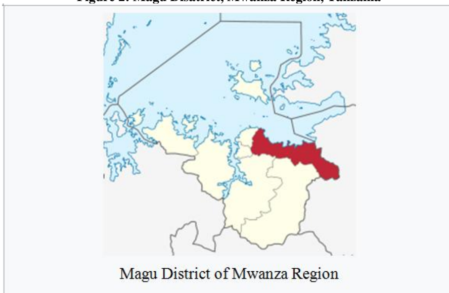
Figure 2: Magu District, Mwanza Region, Tanzania