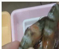
Figure 1. The texture of the tiger prawn segments becomes flexible and mushy