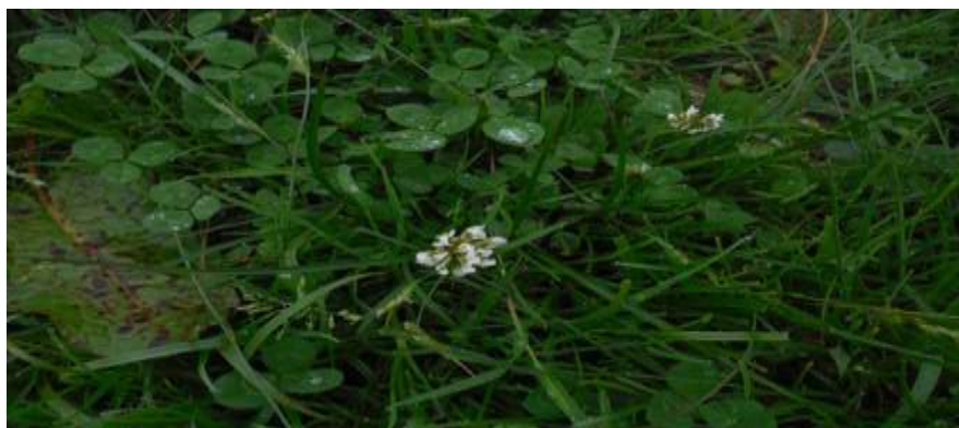
Fig. 4 Trifolium repens -White clover at Meghma