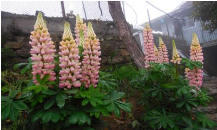
Fig. 6 Lupinus sp. an important Legume plant available in Hills