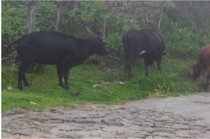
Fig. 5 Grazing animals at Duch white Clover field