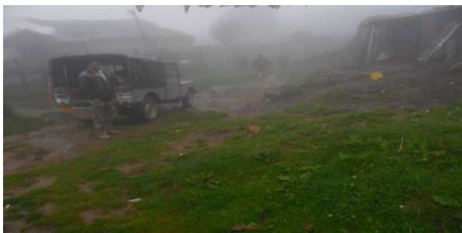
Fig. 3 Group leader watching plant population at Chitray during Tonglu trip