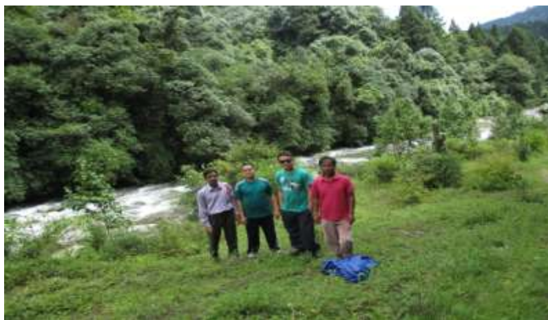
Fig. 10 Research group along with author and forest official at Singalila National Park (SNP) area