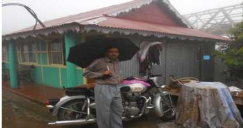
Fig. 8 Author showing use of Biofertilizers (Hill people are much reluctant about biofertilizer use)