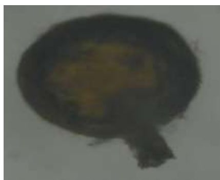
Fig. 12 Glomus sp.,