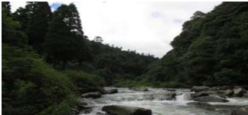
Fig. 9 Gorkhey area during Post monsoon in SNP area