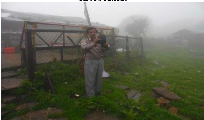
Fig. 2 Author capturing landscape with Trifolium repens at Chitrey