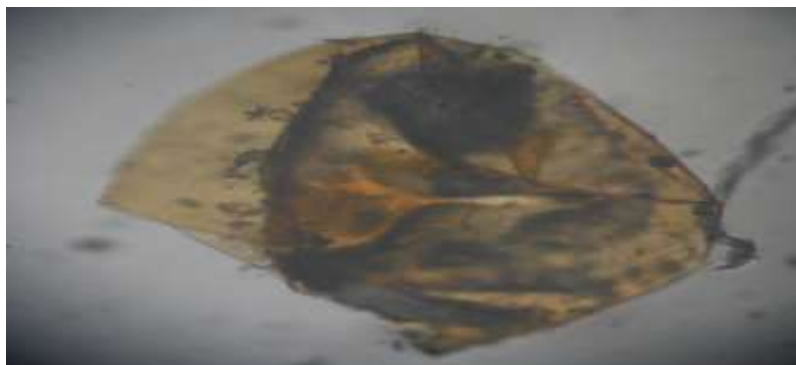
Fig. 11 Gigaspora sp. (Spore of VAMF)