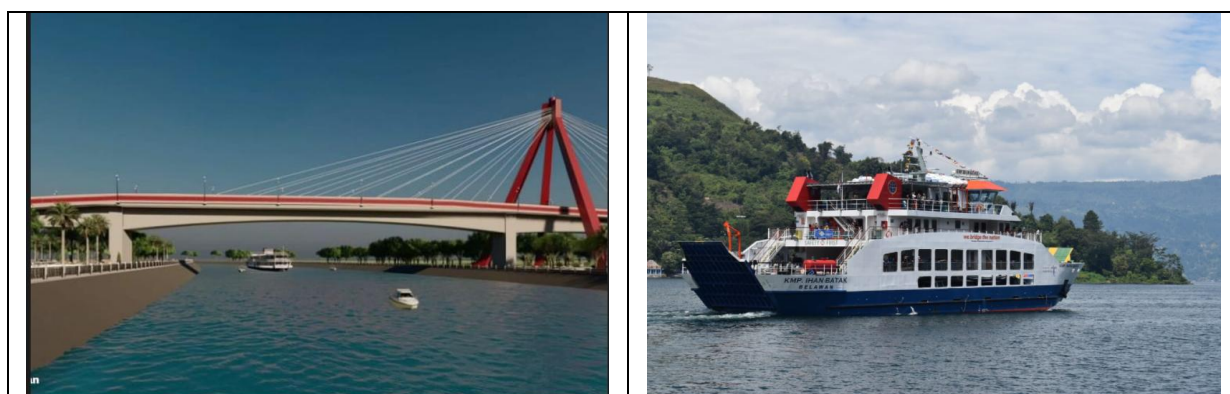
Fig. 1. Infrastructure Development in the Framework of NTSA Super Priority

As a Super Priority NTSA, tourism is expected to be a driver of regional growth, increasing welfare through the creation of business and employment opportunities, increasing local original revenue, creating added value for natural and cultural resources. To achieve this goal, various infrastructures have been, are being and will be built, including the construction of high-way to tourist destinations, airport development in the Lake Toba area, construction of roads and bridges and provision of rolling in and rolling out ferries [4]. The total budget allocated by the government for infrastructure improvement in 2020 reaches IDR 1.25 trillion. For comparison, in 2019 the total expenditures of local government of Samosir Regency were IDR 830 billion. The most prominent infrastructure development in Samosir Regency within the framework of the super priority NTSA is presented in Figure 1.