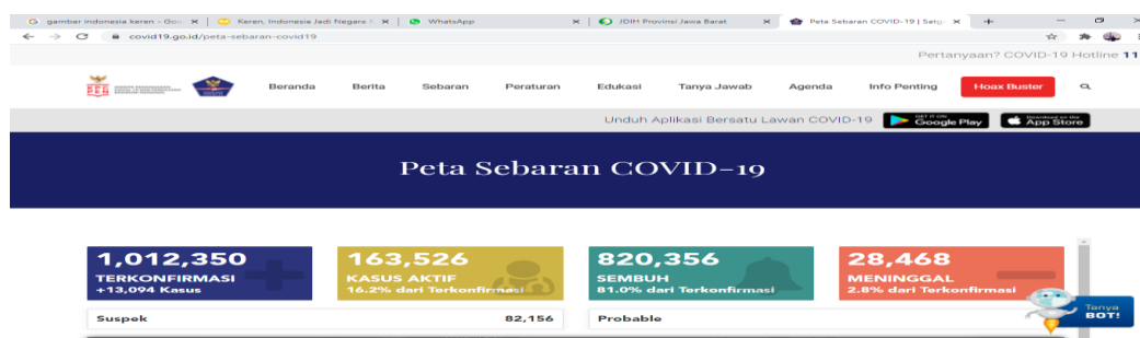
Figure 1. Covid-19 Distribution Map

If the first case of corona virus successfully isolated and cured, Logically Indonesia is free or safe from the corona virus that is now better known as Covid 19, buti n fact thus after that, spread every where almost the entire territory of Indonesia, even until now has not ended