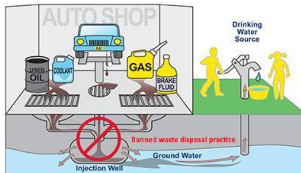
Figure 3: Allowing shop fluids to flow into groundwater is against the law [12].