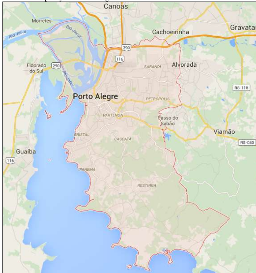
Figure 2. Limits of the municipality of Porto Alegre.

The installation place is located in the Agronomia neighborhood in the city of Porto Alegre. Figure 2 shows the limits of the municipality of Porto Alegre.