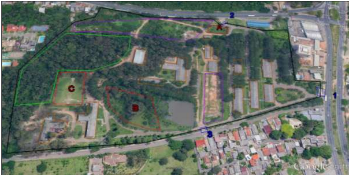
Figure 4. Identification of the elements of the implementation local of the biogas plant.

The local has three transport accesses, the main one for the RS-040 with limited width only for light vehicles. Accesses 2 and 3 are service entrances, with adequate dimensions, for the entry of heavier vehicles, indispensable for the implementation of the project. Access to entrance 2 is by João de Oliveira Remião Street and 3 by Tocantins Street. The total area have approximately 105 km 2 . Consisting of 14 buildings, an on-line high-voltage transmission training area, another for distribution training, a soccer field and an extension of preservation area. Figure 3 indicates each element described above.