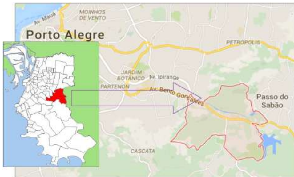
Figure 3. Limits of the neighborhood Agronomia.

Figure 3 shows the boundaries of the Agronomia neighborhood of the eastern zone of the city of Porto Alegre.