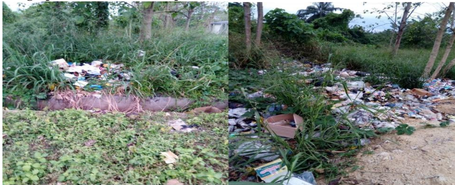
Plates 1: A Plate showing examples of dumpsites

Below are photographs of some of the dumpsites.