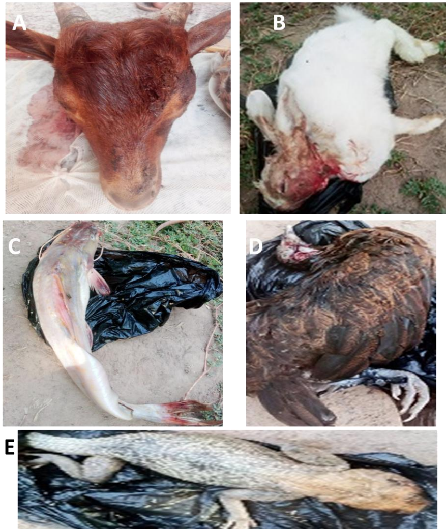
A - Goat head, B - Rabbit, C - Fish, D – Chicken and Lizard Fig. 3.2 Experimental Animal Carrions