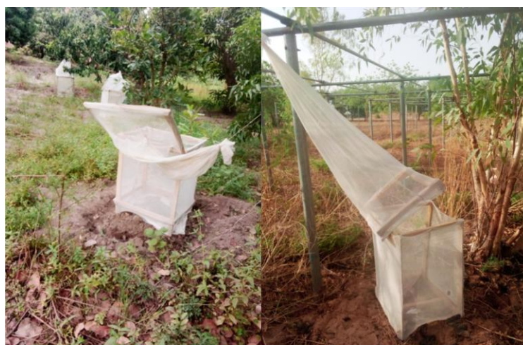
Fig. 3.4 Traps placement

Initially five (5) wooden traps measuring 100x60x60cm constructed and treated with termiticides were placed on the ground separately at a distance 15m apart to avoid the same insects moving from one trap to other. Fresh carrion of selected vertebrate animal was then kept directly on the ground in each of the trap. The traps were so placed that each of them was facilitating the entry of both crawling and flying insects to have access to the carrions through the top and bottom. Each trap was tied to a peg erected bit away from the trap to facilitate easy opening and closing of the traps without scaring away the insects during carcass examination and sample collections. Observations were then made on the types and number of necrophagous arthropods having access to the carrions, identifying the associated arthropods, types and number of predators feeding on the necrophagous arthropods were recorded. The experiment was repeated twice.