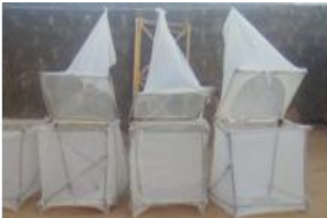
Fig. 3.3 Experimental traps