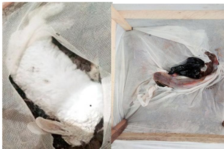
Fig. 3.5 Carrion Placement