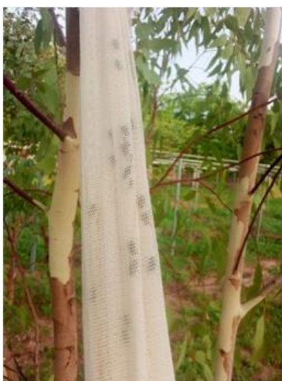
Fig.6 Insects trapped at the Tip end of the trap

Sample collection began the first day of exposure and mark as day 1. The sample were collected two times daily at six hour interval beginning from 8am-4pm to cover day time only when insects diurnal activity should be greatest. The collection period were sometimes changed to cover all day time hours. Flying insects were collected by closing the cover of the trap where all insects within the trap were forced to the tip end of cover. The tip end of this cover was then pushed into the killing jar where the insects were killed (fig. 3.3). Crawling insects, ants, spiders, and other arthropods samples were collected manually by hand picking and killed in a similar way. The number of samples collected was counted and preserved on daily basis up to the end of the experiment. However, only adults samples were collected, eggs and larvae on and around the carrion were only observed not collected to avoid damaging maggots establishing on the carcasses which could consequently interfere with the rate of decomposition process.