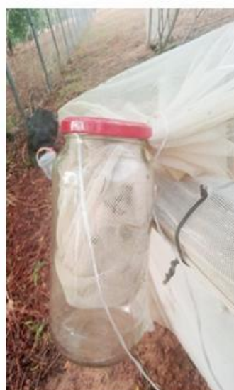
fig.7 Killing the insects in a killing jar