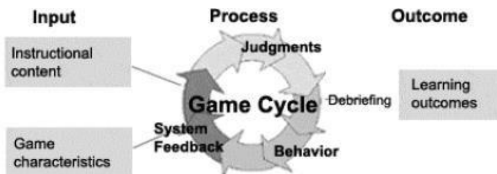
Figure 1: Model of game-based learning by Garris et al, 2002, p.445

Following the definition given by Pho (2015:1), Game-based learning is “borrowing certain gaming principles and applying them to real-life settings to engage users”. That means to use different aspects such as live points, ability points, menu options, competition, etc, to the classroom to help students improve.