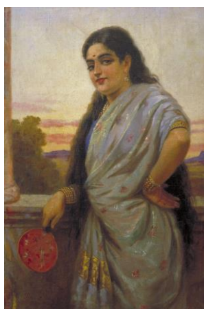
Figure 1 : Woman Holding a Fan by Raja Ravi Varma

Furthermore, the human body has played an essential role in Indian sacred art, reflecting India's cultural and philosophical diversity over the millennia, in which the spiritual and sensual elements of the body are harmoniously intertwined. For instance, Raja Ravi Varma's painting " Woman Holding a Fan " (symbol of Indian women's sensuality)" and Abanindranath Tagore's painting " Mother India " (symbol of Indian women's virtues) illustrate complementary elements of the Indian woman's physique. In reality, the human body is viewed as a "instrument" in Indian sacred art, connecting the "inner psychic world" with the "physical outer world" via Yantras. This fundamental aesthetic component has been utilized in Indian religious art in diverse ways by various Indian painters from the earliest times to modernity. Where the death of the body and reincarnation of the soul in another body help us to become conscious of our true Being. In Indian sacred art, the term "devotion" (in Sanskrit, bhakti) can have different connotations depending on the context. For example, the sacred Hindu text "Bhagavad- Gita" expresses this devotional aspect between Krishna (the spiritual master) and the disciple Arjuna, who is encouraged to conquer his soul (in Sanskrit, Atman). The Hindu god Ardhanarishavara, whose left side is feminine and the right side is masculine (also known as the union of Shakti and Shiva or Prakriti and Purusha), represents human harmony and balance.