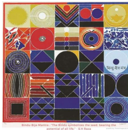
Figure 4: Bindu by SH Raza

Sayed Haider Raza was an Indian painter who lived and worked in France from 1950 until his death, while keeping close relations with India. Despite the fact that he spent much of his life in France, his paintings were influenced by Indian religious iconography and philosophical notions. Not only did he use Indian colors, but he also began inscribing Sanskrit prayers/chants, Urdu and Hindi poetry into his painting. Raza's paintings explore themes such as Prakriti (nature), Kundalini (primal force), Tribhuj (triangle), and Bindu (circle/dot). According to Raza, the Bindu is the center of all creation and existence, and that "Bindu is a source of energy, a source of life." "Life begins here and ends here." Interestingly, Raza's art and design began with the Bindu as well. The bindu is the point at which the concept of Self emerges and eventually collapses. Concentric circles, squares, rectangles, and triangles in blue, yellow, red, orange, and green are set around deep black circles in his Bindu series, evoking yantras and mandalas used for meditative visualization. The geometric patterns interlock to represent the polarity of male and female energy, the yin and yang of created reality.