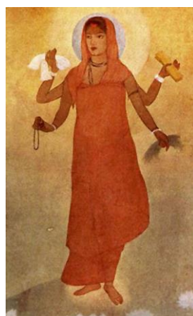
Figure 2: Mother India by Abanindranath Tagore