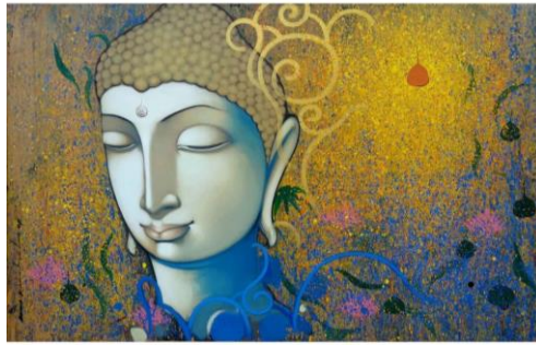
Figure 5: a painting of Lord Buddha by Anand Panchal