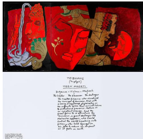
Figure 3: Hindu Triad by MF Hussain