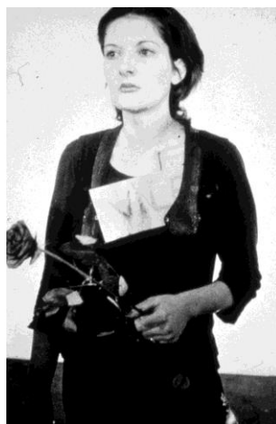
Figure 8: Rhythm 0 by Marina Abramovic