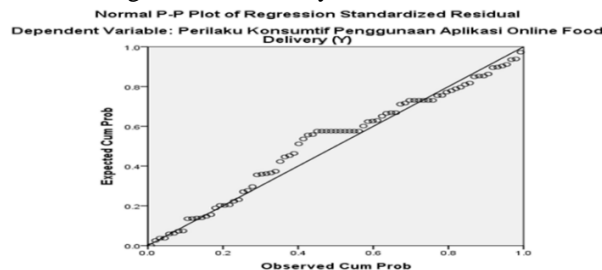
Figure 4.1 Normality Test with Normal Probability Plot

In the p-plot it can be seen that the dots scatter around the diagonal line which is inclined according to the purpose of the diagonal line. Shows that the data used in this research adheres to the assumption of normality and is therefore suitable for testing the regression model.