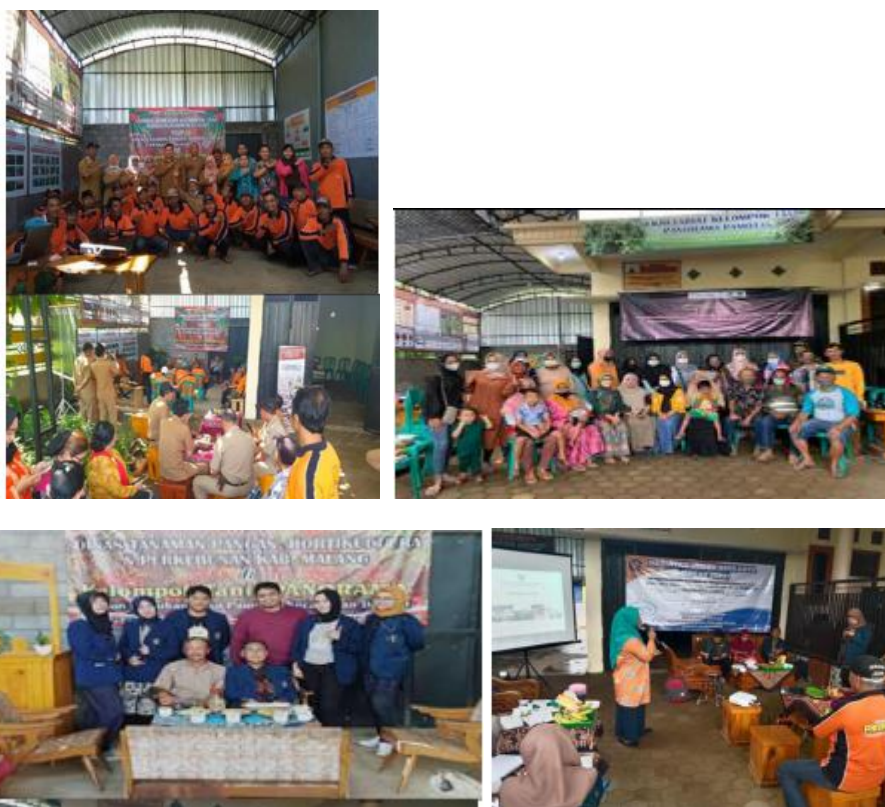
Figure 2. Training Activities Source: Research document, 2024

In 2021, he received a training program from Pejuang Muda (Indonesian Student Community) in the form of: Training on making organic fertilizer and Training on packaging and marketing coffee powder. In 2022, Brawijaya University academics will carry out community service activities using the Focus Group Discussion (FGD) method. This activity is carried out in an effort to increase the understanding and awareness of coffee farmers in managing their coffee farms, this is done so that farmers can produce good and quality robusta coffee, increase the knowledge and understanding of coffee farmers in marketing coffee products, this is so that coffee farmers can market coffee wider and more independent, changing the behavior of coffee farmers in managing coffee plantations, this is done to produce robusta coffee according to the special quality standards desired by factories, traders, consumers and supermarkets, and socializing so that coffee farmers can follow and comply with the desired coffee standards by the factory or supermarket. In 2022, students from PGRI Kanjuruhan Malang University (UNIKAMA) will accompany farmer groups in terms of industrial legality by issuing farmer group NIBs, farmer group Biography IPRs, PB-UMKU and SPP-IRT for Panorama farmer group coffee products.