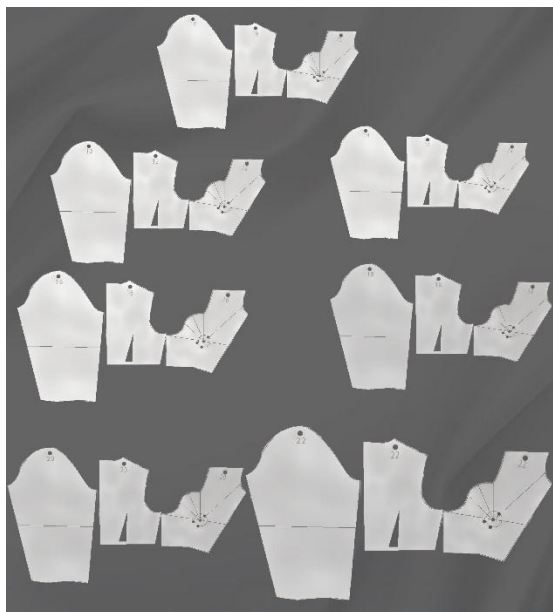
Figure 4.1: Fabricated Acrylic Sheet Patterns in Sizes 10-22

The study demonstrated that acrylic sheets offer a superior alternative to traditional pattern-making materials in terms of durability, reusability, precision, and instructional efficiency. This could lead to the adoption of acrylic patterns in the Department of Fashion Design, thereby enhancing the educational tools available to students and instructors. As can be seen in Figure 4.1.