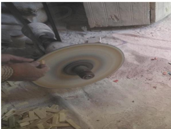
Fig.8. Scrapping of Bones