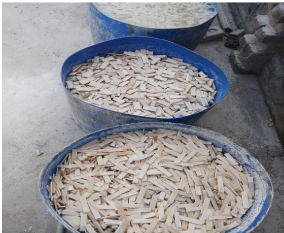
Fig.10. Dry Bones