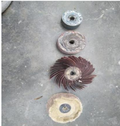
Fig.4. Different types of Buffs and Polishing Pads