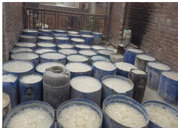
Fig.9. Bones soaked in the solution of