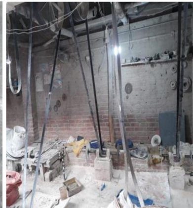
Fig.5. Working Area