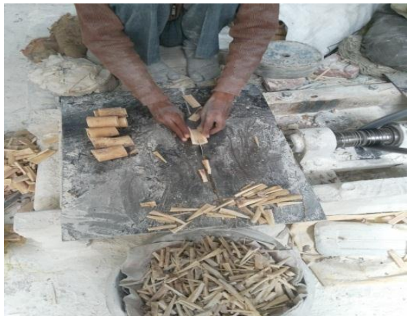
Fig.7. Cutting of Bones