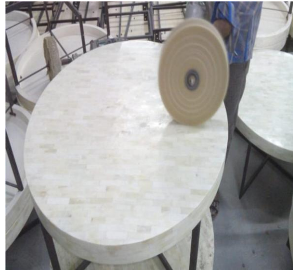
Fig.13. Polishing Hydrogen Peroxide