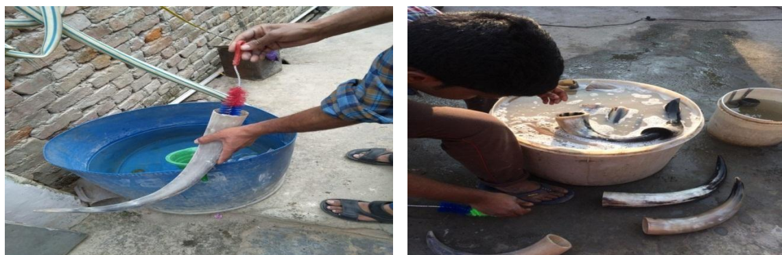
Fig.15. Cleaning after Polishing