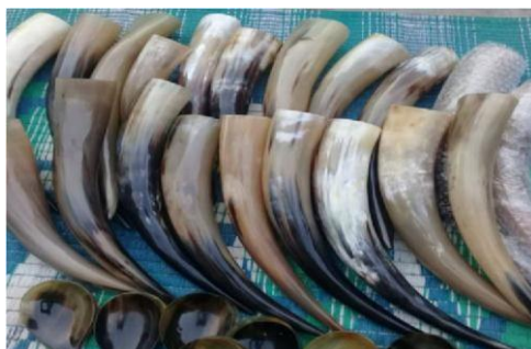
Fig.16. Prepared Horn