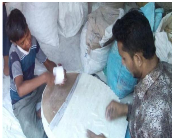
Fig.11. Craftspersons, Sticking Bones to the Base