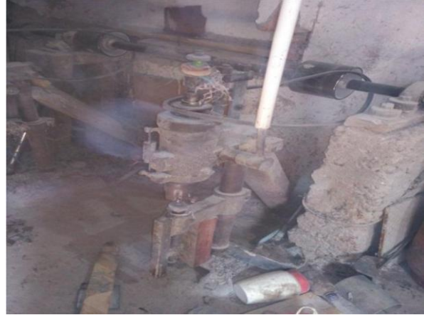
Fig.2. Button Making Machine