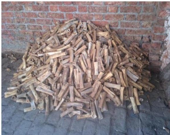
Fig.6. Raw Bones Collection