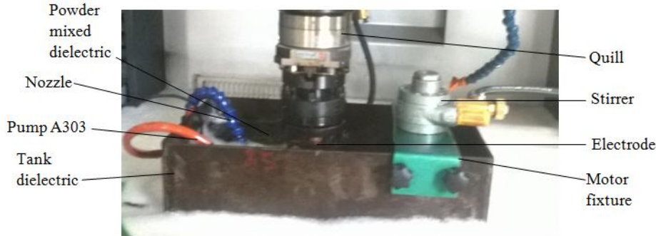
Figure 1. Experimental setup

The experiments were conducted using the electrical discharge machine model CNC-AG40L from Sodick, Inc. USA at The Central Laboratory of Thai Nguyen University of Technology. The material used for the workpiece was SKD61 (Japanese Industrial Standard) hot-die steel that is used extensively for hot-forged dies. The workpiece dimensions were 45 \times 27 \times 5 \text{ mm}^3 (L x W x H). Copper and graphite have excellent electrical and thermal conductivity and both are major commercial materials. The powder material chosen was titanium at 45 \mu\text{m} grain size. The dielectric fluid used was HD-1. The tank was installed in the EDM machine as shown in Figure 1. Machining parameters are shown in Table 1. Surface roughness was measured using a portable SJ-301 machine from Mitutoyo, Japan. A precision balance measured the weight of the workpiece and the electrode before and after the machining process (model vibra AJ-203 shinko max 200 \text{ g} / d = 0.001 \text{ g} , Japan).