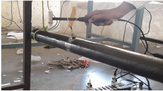
Diagram:1 Experiential set up