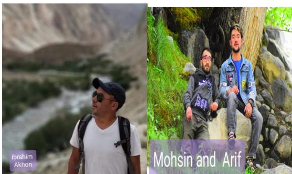
Famous Photographers of Turtuk valley.

Zoological Survey conducted throughout the Turtuk valley from July to October 2020 . Several species of animals 7 species of domestic and 9 species of wild animals were found in the region.