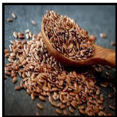
Figure 2: Flaxseed

Flaxseed, commonly known as linseed, has been shown to provide several medicinal benefits. Its constituents have demonstrated anti-inflammatory, antioxidant, antiviral, antibacterial, antifungal, and anti-atherosclerosis activities. Consuming flaxseed regularly is safe, because it cures wounds, protects inflamed skin, increases suppleness, and protects the membranes of the urinary and digestive tracts. The ability of flaxseed extract to create films is advantageous for the healing of wounds .