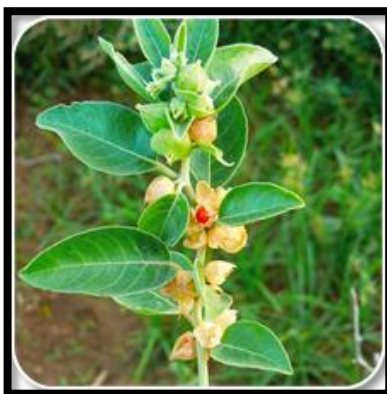
Figure 1 : Plant of Withania Somnifera

It has exhibited antimicrobial, anti-inflammatory, anti-tumor, anti-stress, neuroprotective, cardioprotective, and anti-diabetic properties in preclinical trials. Recently, this has also been utilized to prevent the continued use of certain psychotropic medicines from leading to the growth of dependence.